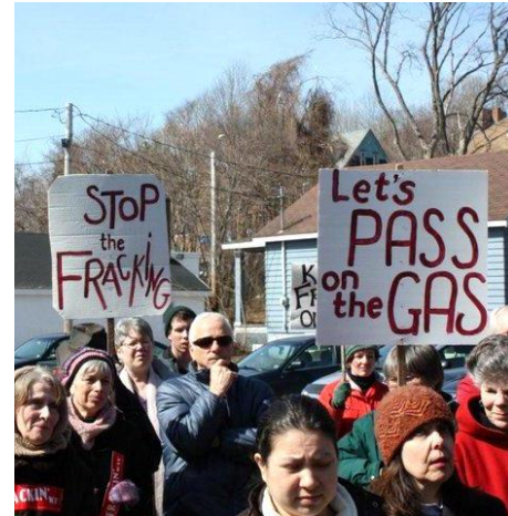
Citizens at an anti-fracking rally in Pictou, Nova Scotia.