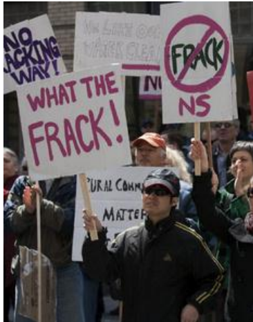
Citizens at an anti-fracking rally in Halifax, Nova Scotia.

Nova Scotians don't want hydraulic fracturing.