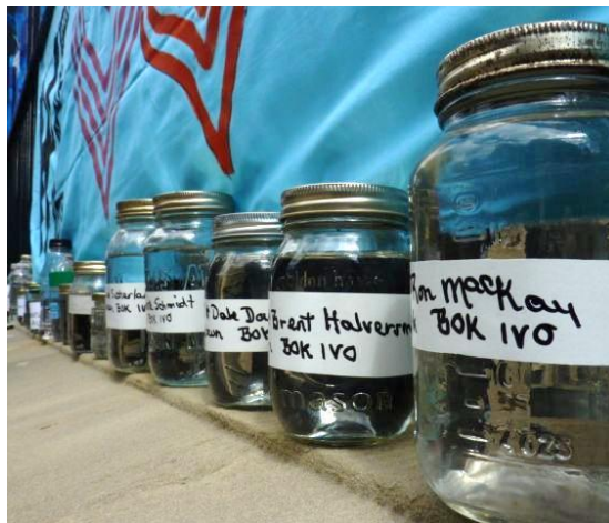
Water from across the province, delivered to Province House by citizens concerned about water contamination by fracking.