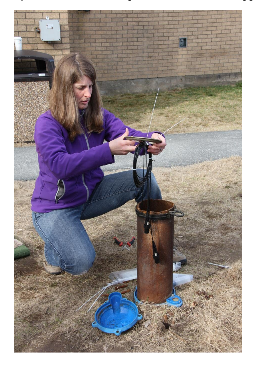
Step 6. Install the hanger, and lower the logger(s) into the well. Snip long ends of zip ties.