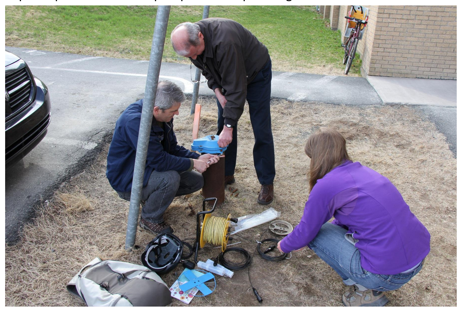
Step 1. Open the well. Keep all pieces and parts together.

After this step, it is a good idea to test whether the hanger which will suspend the loggers, will fit in this well cap. In this photo you can see two types of hangers- a blue 8" hanger at the bottom of the photo, and a steel 6" hanger near my hand. Hangers can be purchased, but can also be built by a welder. Dimensions for a homemade U-hook style hanger are available in this kit. It is also a good idea to take a water level measurement at this step- if the water level is below the length of the logger cable, the logger will not be of use.