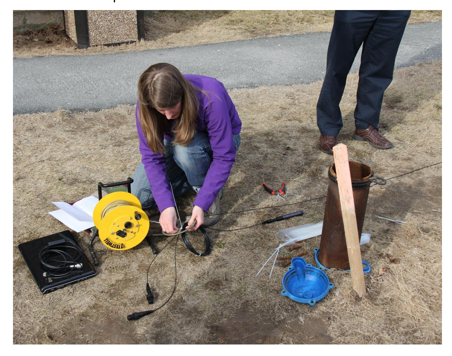
Steps 3 - 4. Loop the cord of the barologger, and secure both loggers to the hanger with at least 5 zipties.

Note here you can see the levelogger cord length is quite long and goes off the page (around 10 m). The barologger cord is quite short, around 1 m. The levelogger must be suspended into the water when it is installed and the barologger must stay above the water level.