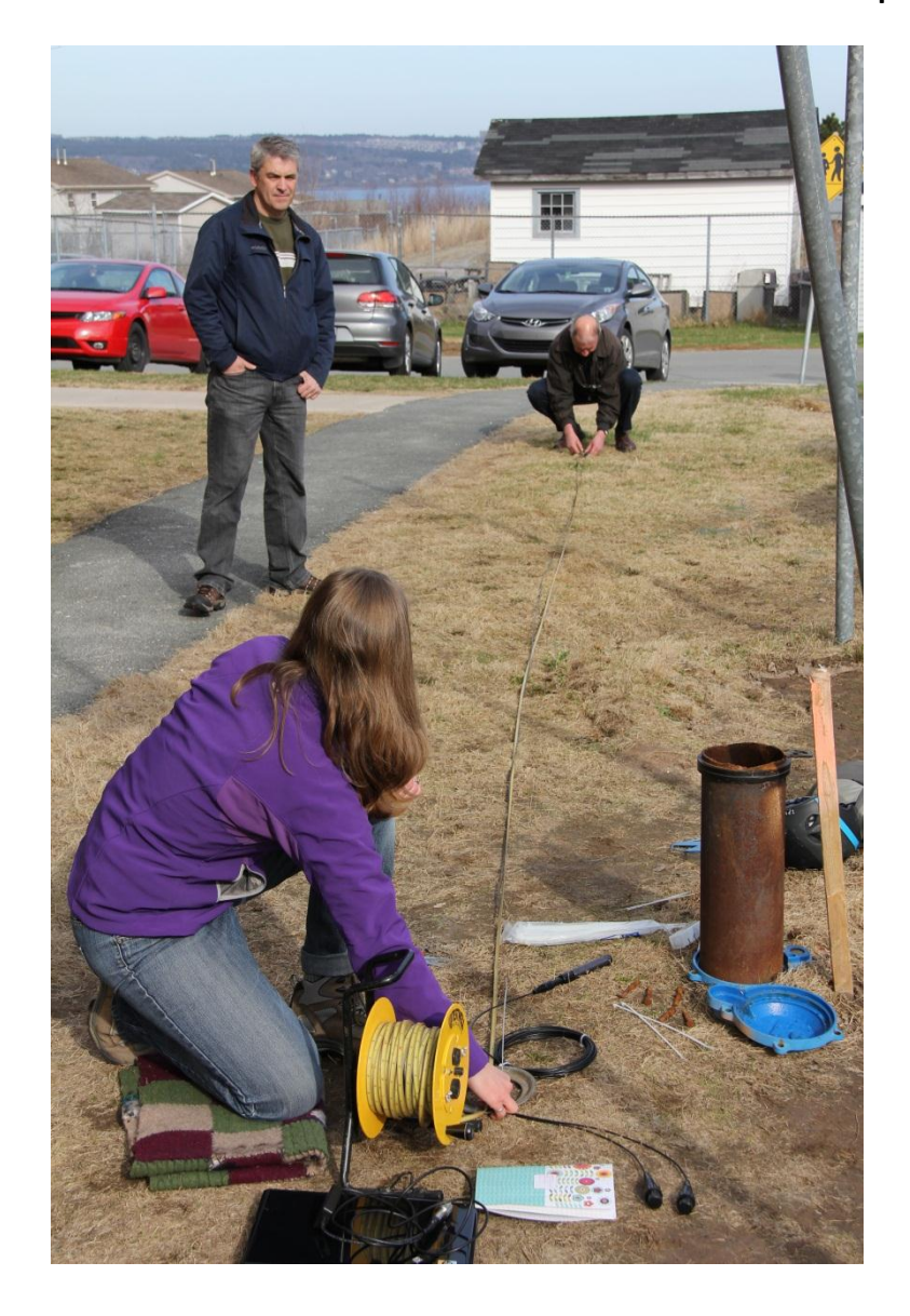
Step 5. With the cords stretched, measure and record the distance from the hanger to each sensor. Use the measurement tape on the water level recorder.